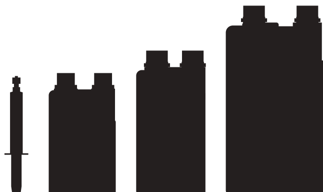
7,5 ML SINGLE-DOSE SYRINGE AND TWO-CAPS BOTTLE WITH DISPENSER (250 AND 350 ML AND 1 LT)